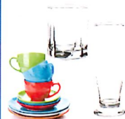
Ceramics, glassware and housewares.