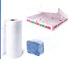
Napkins, paper towels and food soiled cardboard – put these in your organic bin.

These items are NOT accepted with your recycling.