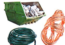
Scrap metal, wires and cables, home and construction waste.