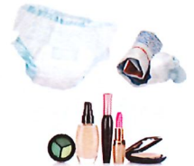
Diapers and personal hygiene products.