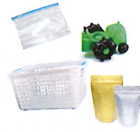
Plastic items not labeled #1-7 or large plastic products.