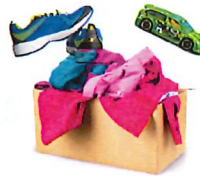
Textiles and other items that can be re-used.