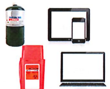
Hazardous waste, sharps and electronics.