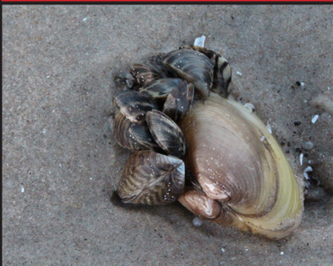
Zebra mussels attached to a native clam, found on Patricia Beach in October 2015